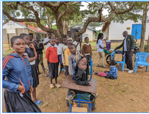
Some of the disabled kids we support

We have a website for your perusal. We try and keep it up to date with the latest news as it comes to us. The link is <a href="https://aidexaustralia.org.au">https://aidexaustralia.org.au</a> We also did a blog of our recent missions trip. See it at <a href="https://heart4africa.tumblr.com">https://heart4africa.tumblr.com</a> Please let me know if you don't want to get these newsletters.